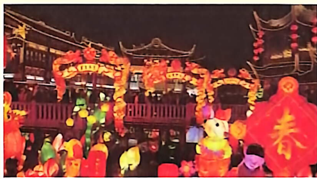
the Spring Festival