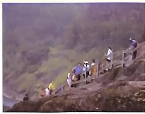
the Double Ninth Festival